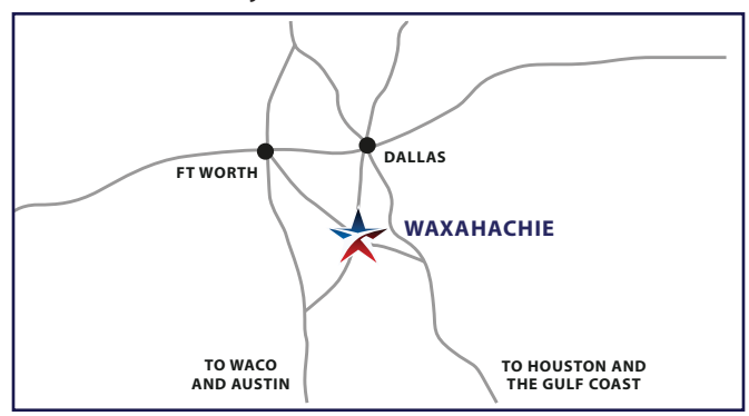
North...30 minutes to Dallas. West...30 minutes to Fort Worth. East...15 miles to I-45 and the Piney Woods of East Texas. South...50 miles to Waco and the Hill Country.

Waxahachie is located at the Crossroads of Interstate 35E and U. S. Highway 287 linking the Gulf and Mexico 1,500+ miles to the archways of Canada. And, Waxahachie is just 15 minutes from I-20 and I-30, both major east-west interstates.