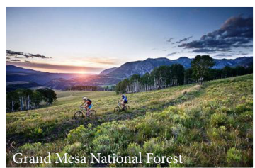
Grand Mesa National Forest