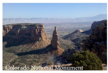
Colorado National Monument

Colorado Wine Country - Palisade, Colorado was recently named in the top 10 Wine Destinations in the United States. The Grand Valley is home to over 20 wineries and vineyards and produces over 75% of Colorado's wine grapes. Join us in September to celebrate at the Colorado Mountain Winefest.