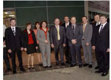
The IMO Group announces their first US plant location in Dorchester County.