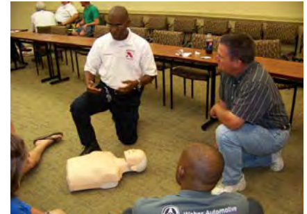
A Dorchester County EMS training officer demonstrates how to perform life-saving CPR as part of a special employee certification training series offered by the DCIC.

During the week-long celebration, Dorchester County Economic Development hosted the 21st Annual Industry Appreciation Week Golf Tournament at the Pine Forest Country Club in Summerville. Participation in the tournament was at no cost to representatives of existing industries. At 18 teams, this year's tournament held a record-high of industries competing for the coveted trophy. The Arntz, Inc. team, comprised of four players, will proudly display the trophy until tournament time in 2011.