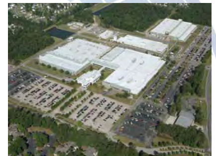
Robert Bosch Plant in Dorchester County