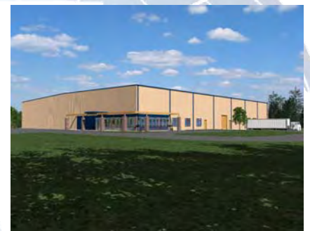
"Virtual Spec" building designed for the New Century Industrial Park.

"Dorchester County. The right place for... your business, your family, your life. "