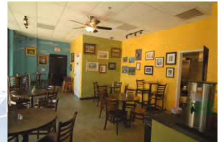
Dining in Downtown Summerville