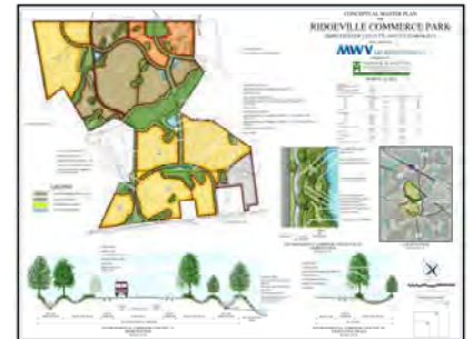
Ridgeville Commerce Park Concept Plan