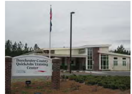
Dorchester County QuickJobs Training Center located in St. George.