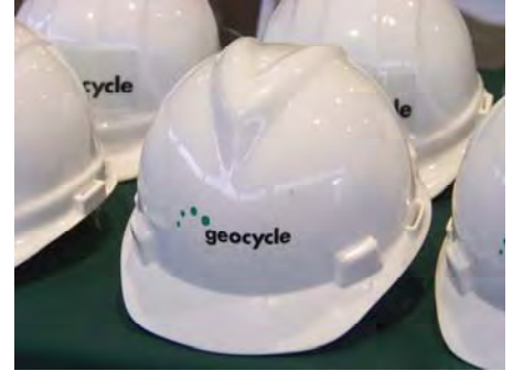
Geocycle, the first announcement in 2010, disclosed their $7 million facility expansion plans.

Providing guidance and assistance, the Dorchester County Economic Development Visitation Program was created in an effort to offer a one-on-one opportunity to the County's existing industries. During 2010, a total of 48 visits were conducted. This ongoing program is key in helping build strong relationships with our local industry base, as well as discuss any company-specific issues that may arise. It is also through this program that industries are made aware of the support and assistance available to them from various sources on local, state, and national levels.