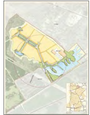
Pine Hill Commerce Park Concept Plan

As an environmentally friendly project, this grant will mark Dorchester County's first initiative to direct wastewater within the County. The County intends to match the EDA grant with funds borrowed from the South Carolina Department of Health and Environmental Control's revolving loan fund. Expected to save 80,000 gallons of water per day in 2011, this "green" project will reduce the consumption of energy, the pollution to water, and the use of hazardous chemicals. The completion of this project will result in replacing 30% of the plant's cooling tower water, and 75% of process water with treated wastewater.