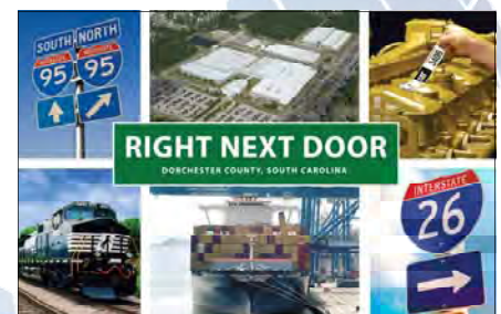
Marketing Campaign Postcard